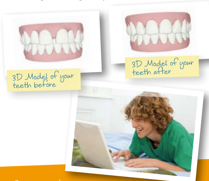
3D Model of your teeth before

Get started right away – ask your dental practitioner if Invisalign Teen is right for you!